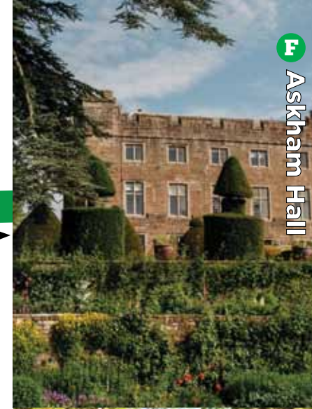
F Askham Hall