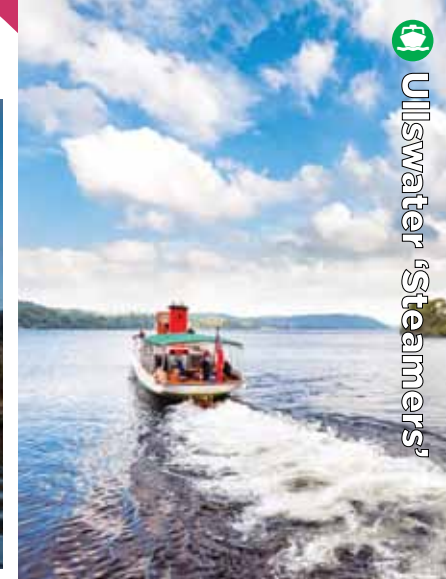
H Ullswater 'Steamers'