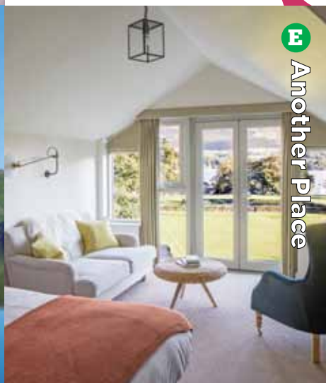
E Another Place