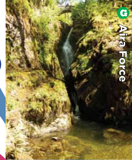
G Aira Force